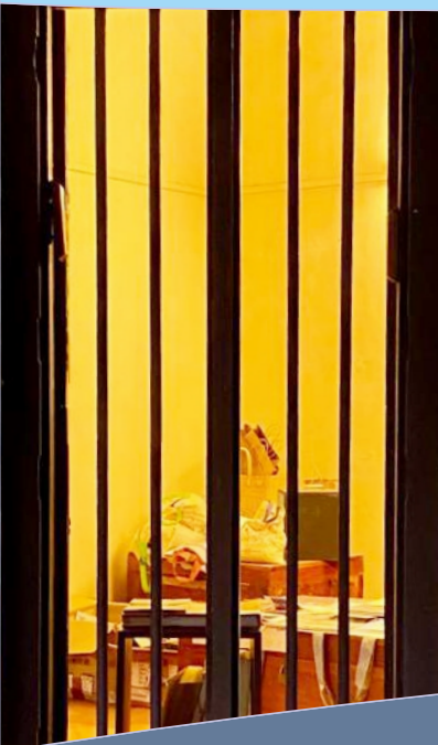
Museum of Digital Society - Mysore, IN

We have a space to call “our own” now. This space reminds us that digital rights and freedom of expression online are closely linked to creating safe spaces for art and culture and are not mutually exclusive